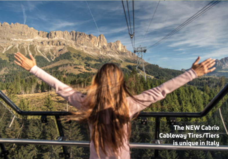
The NEW Cabrio Cableway Tires/Tiers is unique in Italy